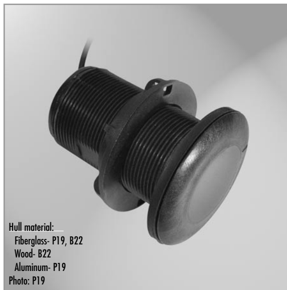
Hull material: Fiberglass- P19, B22 Wood- B22 Aluminum- P19 Photo: P19