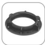
Plastic Hull Nut: P19: 04-004