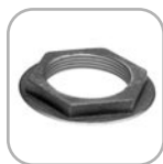
Bronze Hull Nut: B22: 02-030