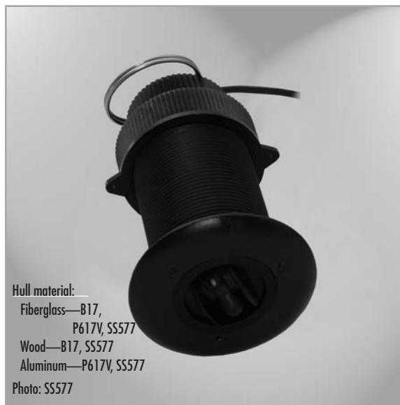
Hull material: Fiberglass—B17, P617V, SS577 Wood—B17, SS577 Aluminum—P617V, SS577 Photo: SS577